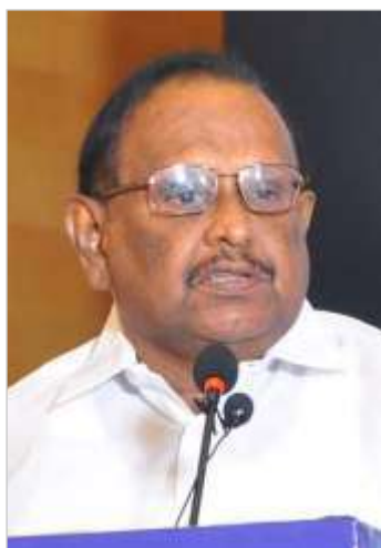
Mr. S. Regupathy Hon'ble Minister for Law, Courts, Prisons and Prevention of Corruption Govt. of Tamil Nadu delivering the 'Guest of Honour Address'