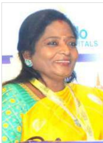
H.E. Dr. Tamilsal Soundararajan Hon'ble Governor of Telangana, Lieutenant Governor of Puducherry (Additional Charge) delivering the 'Chief Guest Address'