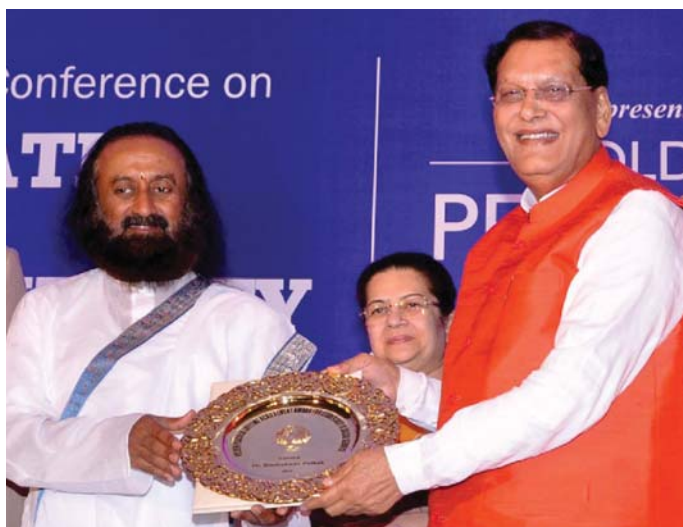
Sri Sri Ravi Shankar, Founder, The Art of Living presenting Golden Peacock Lifetime Achievement Award to Dr. Bindeshwar Pathak , Founder, Sulabh International Social Service Organization. Also seen, Ms. Rajashree Birla , Chairperson, Aditya Birla Centre for Community Development, Aditya Birla Group

The Jury is Chaired by Justice M. N. Venkatachaliah , former Chief Justice, Supreme Court of India and former Chairman, National Human Rights Commission of India and National Commission for Constitution of India Reforms.