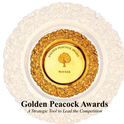
Golden Peacock Awards A Strategic Tool to Lead the Competition

The three decades journey of the 'Golden Peacock Awards' has witnessed many significant transformations in terms of the range of information in the application formats, objective evaluation techniques, expertise in assessment procedures