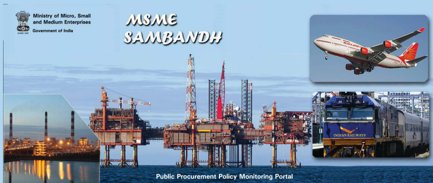
Figure 1; MSME Sambandh Portal: A view