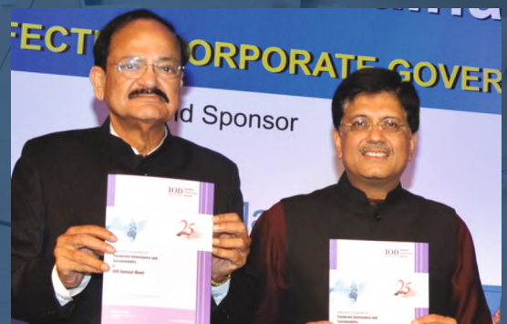
Mr. M. Venkalah Naidu , (the then) Hon'ble Union Minister of Urban Development, Housing and Urban Poverty Alleviation and Parliamentary Affairs, Govt. of India and Mr. Piyush Goyal , (the then) Hon'ble Union Minister of State with Independent Charge for Power, Coal and New & Renewable Energy, Govt. of India at the IOD Annual Meet in 2014

The ability to successfully drive and deliver the change agenda is, what sets IOD apart.