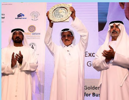
His Highness Sheikh Nahyan bin Mubarak Al Nahyan, Cabinet Member and Minister of Tolerance, Govt. of UAE (Right) and His Highness Sheikh Ahmed bin Saeed Al Maktoum, President, Dubai Civil Aviation Authority, Chairman and Chief Executive, The Emirates Airline & Group Chairman, Dubai World (Left) presenting the Golden Peacock Award to H.E. Dr. Khalaf Ahmad Al Habtoor, Group Chairman, Al Habtoor Group, UAE (centre)