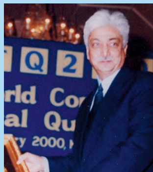
Dr. Azim H. Premji Chairman, Wipro Group receiving the Golden Peacock Business Leadership Award