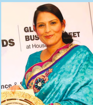
The Rt. Hon. Priti Patel MP Cabinet Minister & Secretary of State for International Development, Govt. of UK receiving the Golden Peacock Global Award for Leadership in Public Service & UK-India Economic Relations