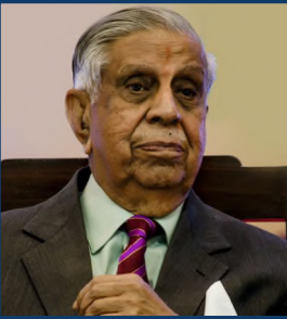
Justice M. N. Venkatachaliah Chairman, Institute of Directors

former Chief Justice of India former Chairman, National Human Rights Commission of India former Chairman National Commission for Constitution of India Reforms