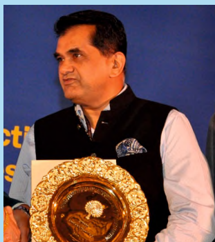
Mr. Amitabh Kant, IAS Chief Executive Officer, NITI Aayog, Govt. of India receiving the Golden Peacock Award for Leadership in Economic Transformation