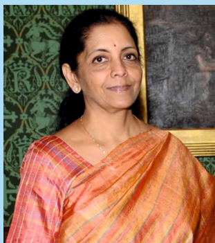
Ms. Nirmala Sitharaman Hon'ble Union Minister of State (IC) for Commerce and Industry Govt. of India addressing the IOD's London Global Convention in 2014