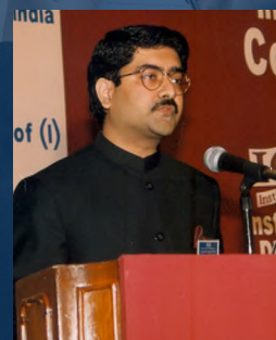
Mr. Kumar Mangalam Birla Chairman, Aditya Birla Group addressing the IOD Convention