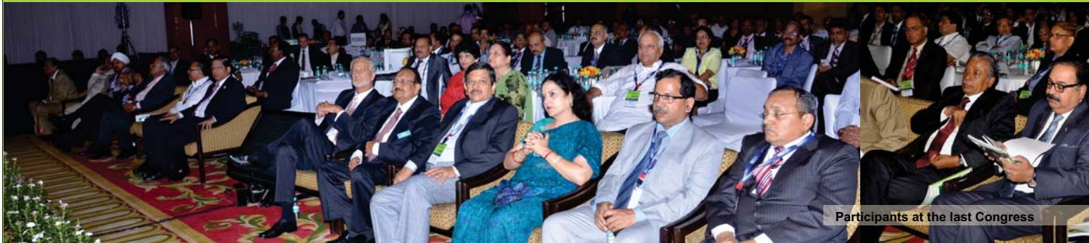
Participants at the last Congress