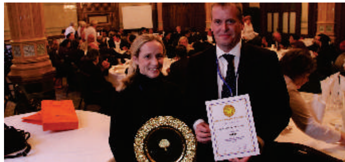
Golden Peacock Award Presentation in London