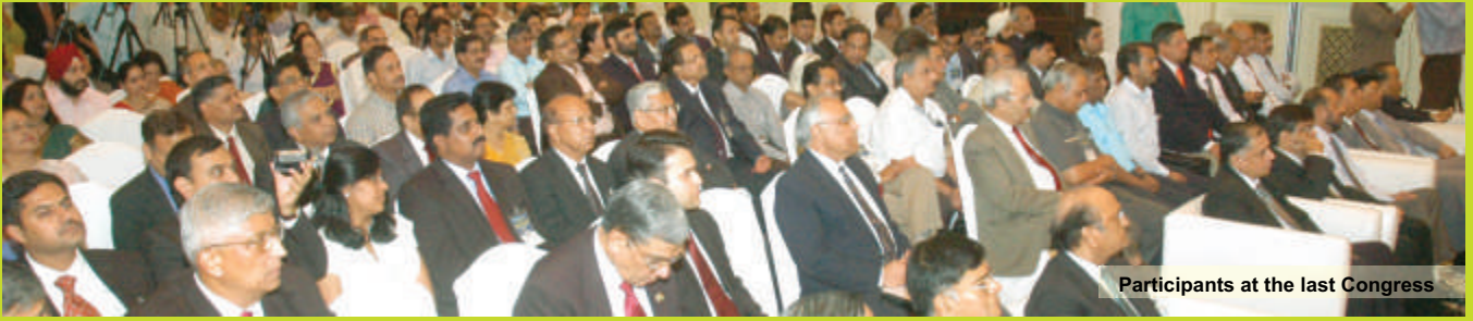
Participants at the last Congress