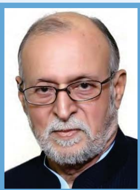
H.E. Mr. Anil Baijal Hon'ble Lt. Governor Government of N.C.T. of Delhi