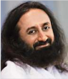
Sri Sri Ravi Shankar Founder Art of Living Foundation