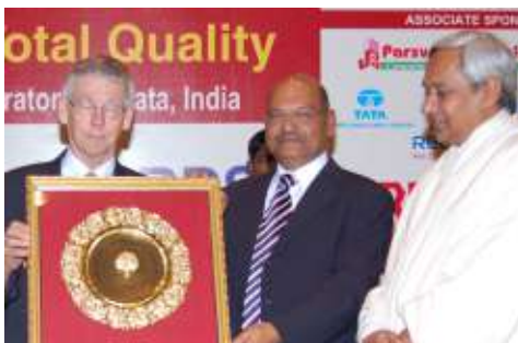
Mr. Anil Agarwal Founder Chairman, Vedanta Group receiving the Golden Peacock Business Leadership Award. Also seen (on Right), Mr. Naveen Patnaik , Hon'ble Chief Minister, Govt. of Odisha

The Guidelines-cum- Application Forms and self-assessment criteria can be downloaded from website www.goldenpeacockaward.com