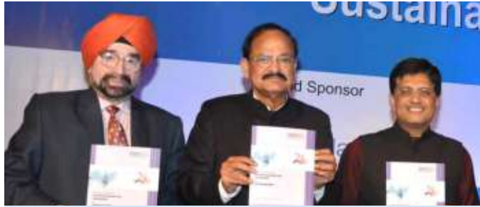
M. Venkaiah Naidu , (the then) Hon'ble Union Minister of Urban Development, Housing and Urban Poverty Alleviation and Parliamentary Affairs and Piyush Goyal , (the then) Hon'ble Minister of State with Independent Charge for Power, Coal, New and Renewable Energy releasing the Convention Souvenir along with Lt. Gen. J. S. Ahluwalia , President, IOD.