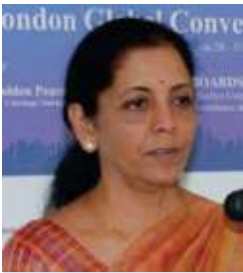
Mrs. Nirmala Sitharaman (the then) Union Minister for Commerce and Industry (Independent Charge), Minister of State for Finance and Corporate Affairs, Govt. of India