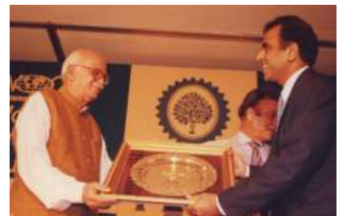
Mr. Sunil Bharti Mittal Chairman, Bharti Enterprise Limited receiving Golden Peacock Business Leadership Award