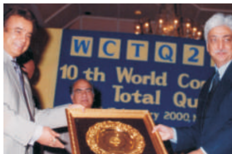
Dr. Azim H. Premji Chairman, Wipro Group receiving the Golden Peacock Business Leadership Award