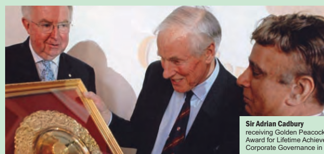
Sir Adrian Cadbury receiving Golden Peacock Global Award for Lifetime Achievement in Corporate Governance in 2016

Currently, the Golden Peacock Awards Secretariat is inviting applications for the following institutional awards for 2017: