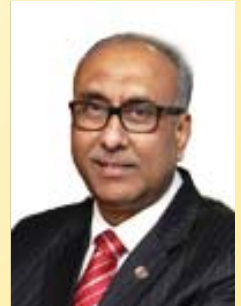
Shri S. S. Mundra Former Deputy Governor Reserve Bank of India