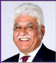
Rakesh Bharti Mittal Vice-Chairman Bharti Enterprises India