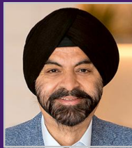
Ajay Banga the then Chief Executive Officer Mastercard Inc., USA