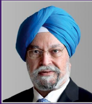
Hardeep Singh Puri the then Hon'ble Union Minister for Housing & Urban Affairs (I/C) Civil Aviation (I/C); & MoS Commerce & Industry Govt. of India