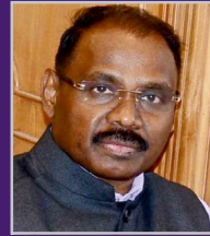
Girish Chandra Murmu, IAS Comptroller & Auditor General of India