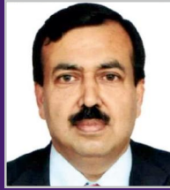
Sudhanshu Pandey, IAS the then Secretary, Department of Food and Public Distribution Ministry of Consumer Affairs, Food & Public Distribution Govt. of India