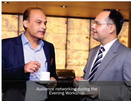
Audience networking during the Evening Workshop