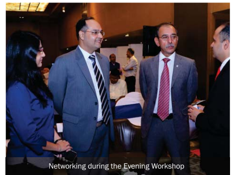
Networking during the Evening Workshop