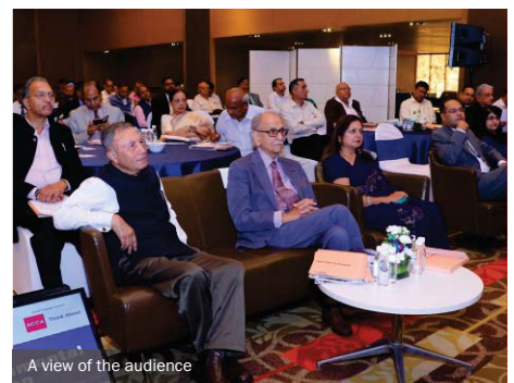
A view of the audience