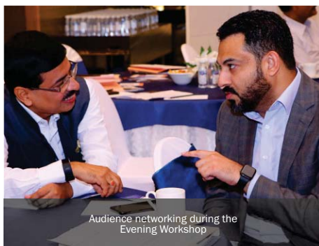
Audience networking during the Evening Workshop