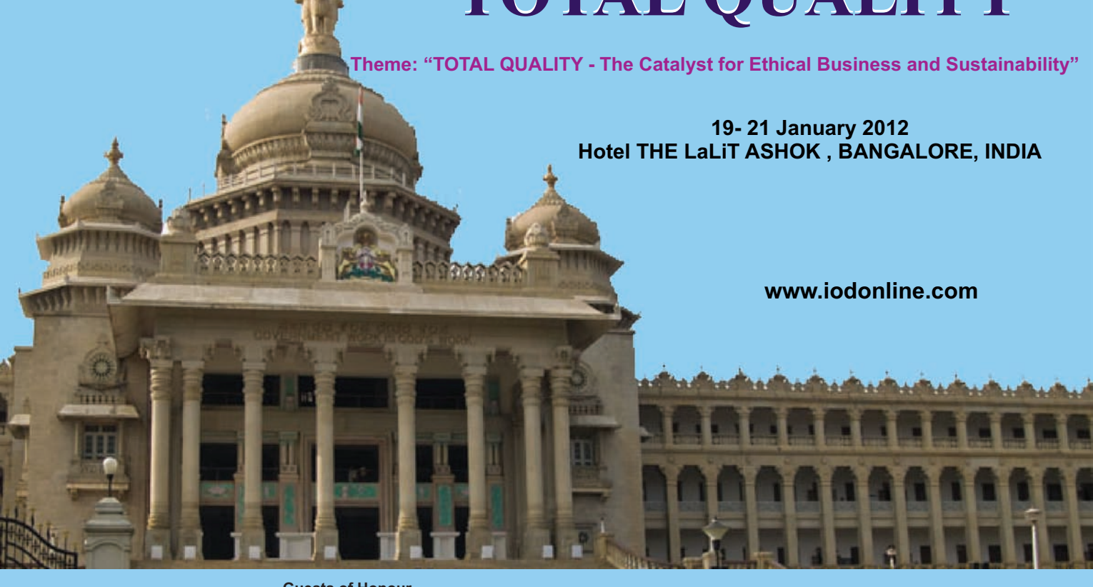
Guests of Honour