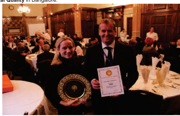
Golden Peacock Awards Nite

The above Awards will be presented during the above 22nd World Congress on Total Quality in Bangalore.