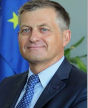
H.E. Andrea Matteo Fontana Ambassador European Union to United Arab Emirates

H. E. Hon. Sayyad ABD-AL-Cader SAYED-HOSSEN (the then) Minister of Industry, Commerce and Consumer Protection Govt. of Mauritius