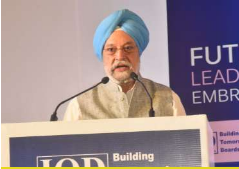
Mr. Hardeep Singh Puri Hon'ble Minister of Petroleum and Natural Gas and Minister of Housing and Urban Affairs Government of India