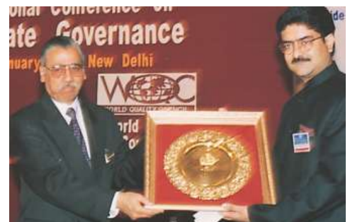
Mr. Kumar Mangalam Birla , Chairman, Aditya Birla Group receiving the Golden Peacock Business Leadership Award