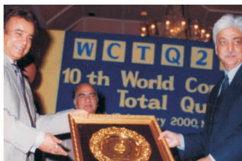
Dr. Azim H. Premji Chairman, Wipro Group receiving the Golden Peacock Business Leadership Award