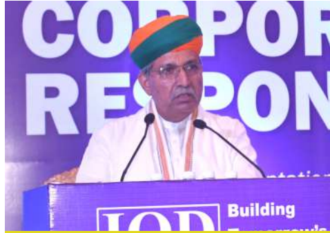
Mr. Arjun Ram Meghwal Hon'ble Union Minister of State for Parliamentary Affairs and Culture Government of India