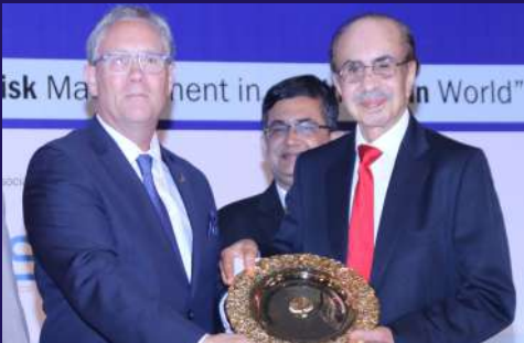
Mr. Adi Godrej , Chairman, Godrej Group receiving the Golden Peacock Lifetime Achievement Award for Ethical Leadership