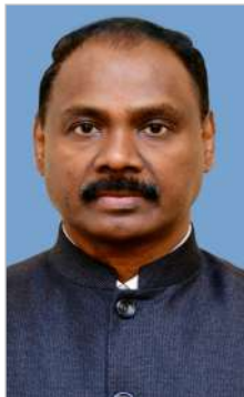
Mr. Girish C. Murmu, IAS Comptroller & Auditor General of India