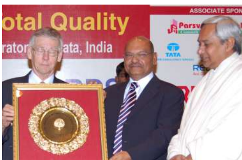
Mr. Anil Agarwal Founder Chairman, Vedanta Group receiving the Golden Peacock Business Leadership Award. Also seen (on Right), Mr. Naveen Patnaik , Hon'ble Chief Minister, Govt. of Odisha

The Guidelines-cum- Application Forms and self-assessment criteria are available on website www.goldenpeacockaward.com