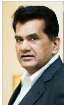
Mr. Amitabh Kant, IAS India's G-20 Sherpa formerly, CEO, Niti Ayog