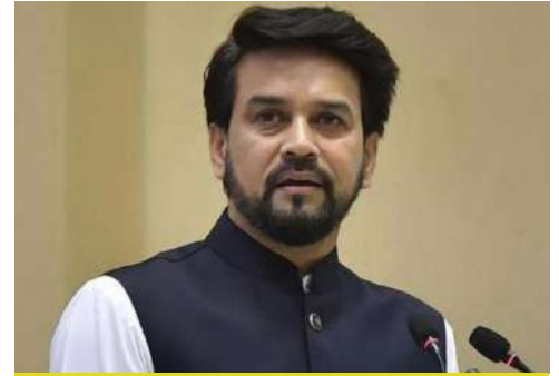
Mr. Anurag Singh Thakur Hon'ble Union Minister of State for Finance & Corporate Affairs, Government of India